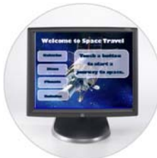
Touch Presenter™ in a desktop solution with a 19" ELO touch panel monitor

Touch Presenter™ also has built-in security features to keep your kiosk safe from unauthorized access.